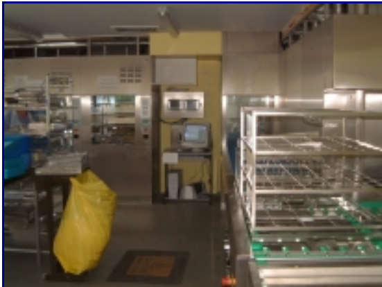
New sectional washer/ disinfectors. Capable of cleaning up to 45 surgical sets per hour

Jayne-Anne Webb, SSD Manager would like to thank all her staff for maintaining the good level of service whilst working in difficult conditions as well as coping with the